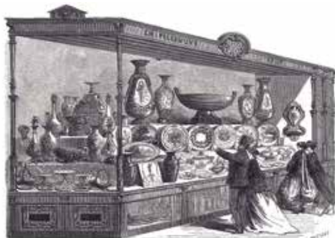
Illustration de la Porcelaine de la Manufacture de la Seine 1878.

It didn't take long after that for Pillivuyt to start exporting their products to the four corners of the globe, where they would feature in both prestigious professional kitchens and private households.